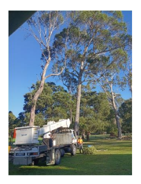
The Tree Doctor removing some high limbs that had broken off and were hanging precariously