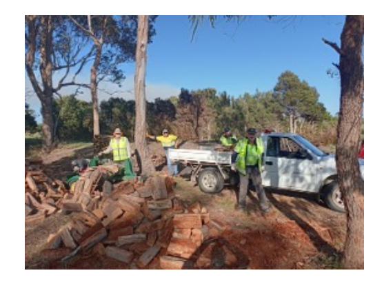
Scott Westlake and the crew splitting some wood