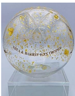
The perpetual trophy