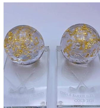
One to take home for the winners